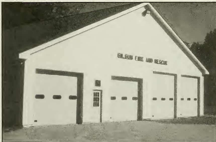
Gilsum Fire Station Addition Completed in 2000